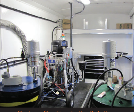
Custom Coating Trailer Solutio

Drawing on the Howard Marten teams vast experience, we take projects from conceptual design through to a reliable finished product. Some of our in-house capabilities include: